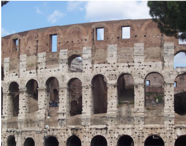
The Colosseum or, more correctly, the Flavian Amphitheatre in Rome

icon of St. Ignatius of Antioch being consumed by lions in the Colosseum in 115 A.D. flashed before my eyes. I could see young mothers, trying to protect their children, while crowds lusted for their blood in the stadium seats high above. I shuddered at the thought of the thousands of people who came to the 'games' to satiate an inhuman desire for violence. I wept for all who lost their lives here.