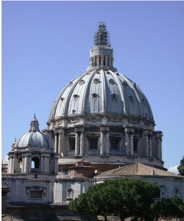
The Dome of St. Peter's Basilica