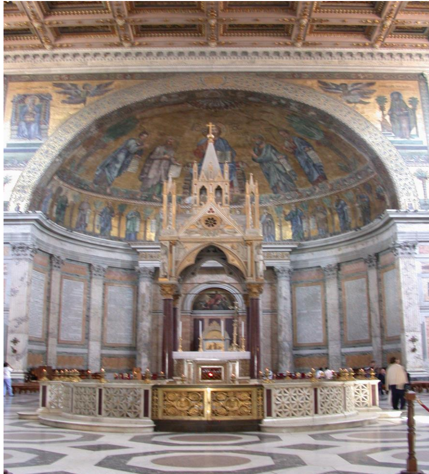
The main altar of the Basilica of St. Paul's outside-the-walls beneath which are buried the relics of St. Paul and St. Timothy the Apostles

Facing danger at sea and fearful persecution, you became a chosen vessel of the Savior. With your sermons you enlightened the nations and to the Athenians you revealed the unknown God. Teacher of the nations, St. Paul the Apostle, protector of us all: Keep us who honor you, safe from every trial and danger.