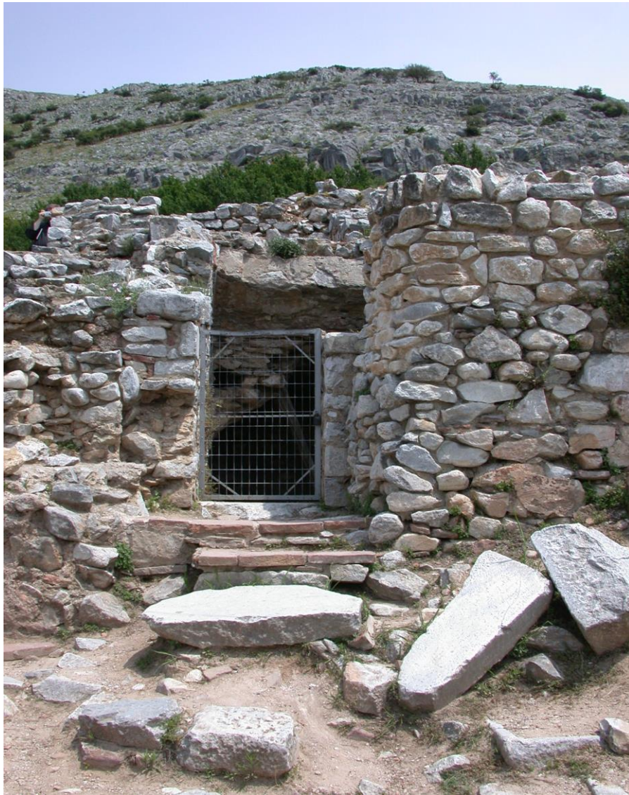
The site of the prison where St. Paul was held captive in Philippi (Acts 16:16-40)

The museum at the archeological site at Philippi was closed, but the site itself was open, so we grabbed a few brochures and headed out to explore. By far, the most overwhelming moment for me was to stand before the place where Paul and Silas were jailed. Having read the story in Acts 16:16-40 many times over the years did not prepare me for my own reaction: all of a sudden, this was not just a story. I was confronted with the reality of what actually took place. Paul and Silas, having just been beaten, were thrown into this very prison that I stood before. As they were praying and singing hymns to God, and earthquake freed them...and the jailer, falling at their feet, cried out, "Men, what must I do to be saved?" This was a critical