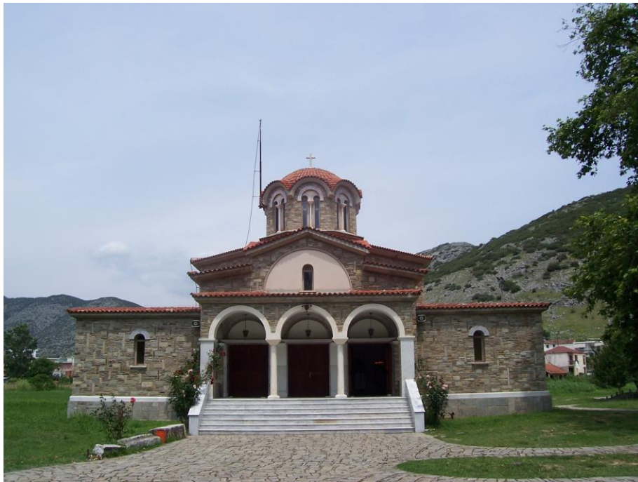
The Church of St. Lydia near Philippi (Acts 16:12-15)