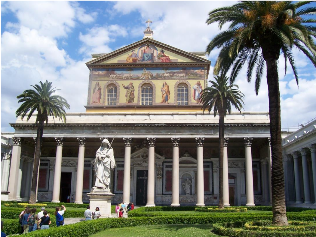
The Church of St. Paul's outside-the walls, where the relics of St. Paul are buried

representation of Father God on the ceiling, which doesn't seem to be a problem for the Roman Catholics. The second layer contained a remarkable memorial marker and monument: the tomb of St Cyril! It was Cyril and his brother, Methodios, who brought the gospel to the Slavic peoples. The 3rd layer looked like an old city, complete with streets.