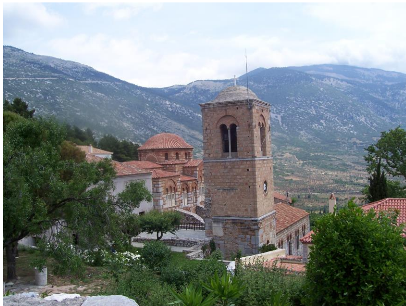
The 10th century Monastery of St. Luke of Steiris (Osios Loukas)