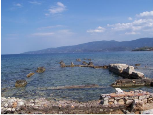
The remains of the foundations of an ancient Byzantine Church at Cenchreae

From here we departed to visit Cenchreae, the ancient eastern port of Corinth, which is where Paul shaved his head "because of a vow he had taken" (Acts 18:18). We stopped by the small harbor from which he sailed to Ephesus while on his second missionary journey around the Mediterranean Sea. Today this is a very picturesque beach. As I walked among the ruins in the blue waters, I envisioned Paul setting sail.